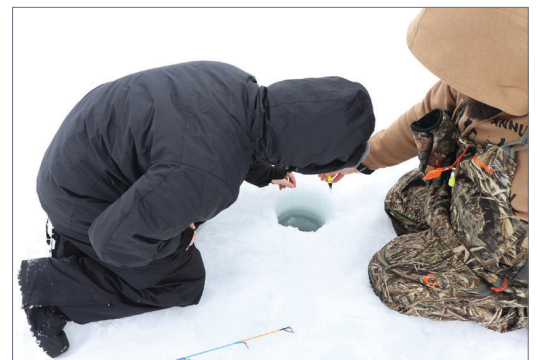
The Nexus-Mille Lacs Annual Ice Fishing Derby.